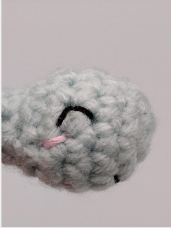
Image 12: (embroider an upside-down v on each side of the face, and add some pink thread below the eye)

Note: there is no right or wrong way to embroider the turtle's face. Just have fun with it!