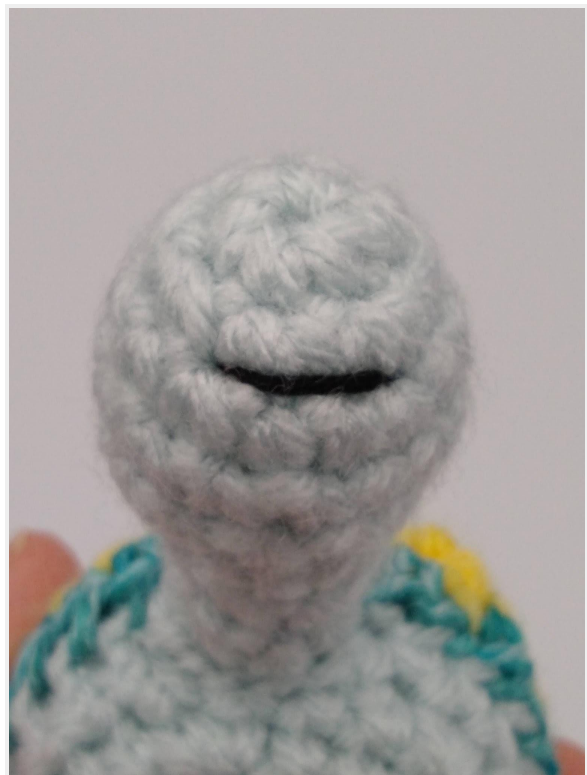
Image 14: (Add a smile with some black thread between at least 3 sts)