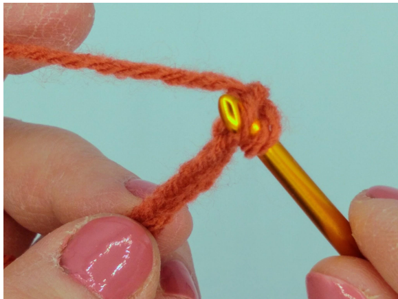
Sc into the second ch from the hook.