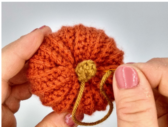
Begin to sew the stem in place. If needed, pin the stem to keep it from moving when sewing.