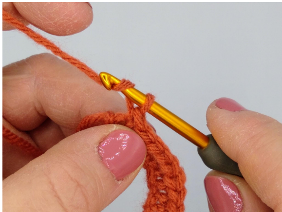
Continue to sc in the remaining 18 sts on the foundation chain, ch 1, and turn