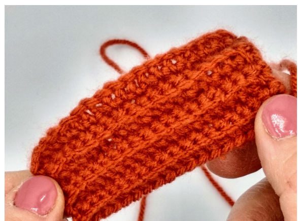
This is how your rib stitch should look.