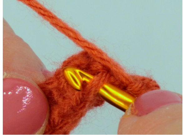
For the rib stitch crochet in the blo of the st.