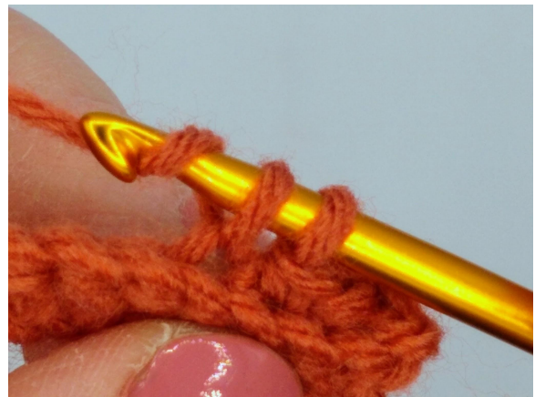
Continue crocheting in the blo of the sts, until the end of the row, ch1, turn,