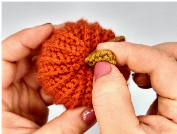
Place the stem into the center of the pumpkin.