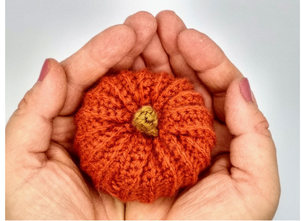
This is how the pumpkin should look when finished.