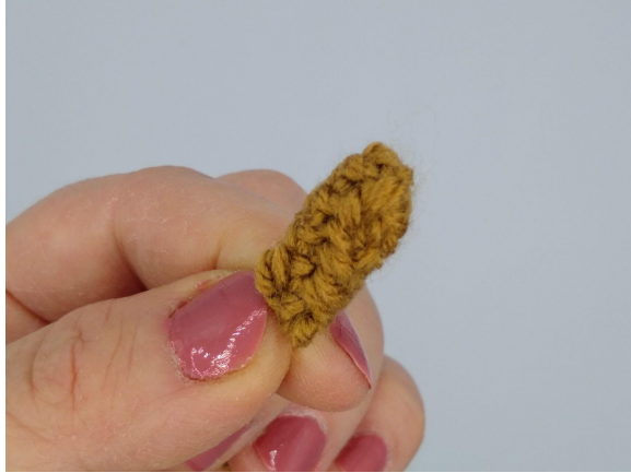
This is how the finished stem should look.