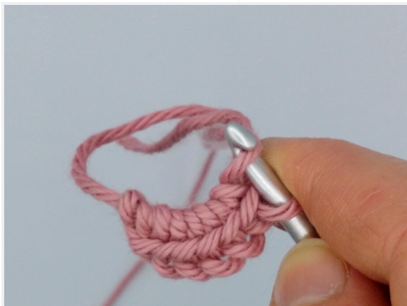
Place 12 sc in the magic ring.