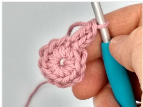
Place 1 dc into the same st as the ch 2.