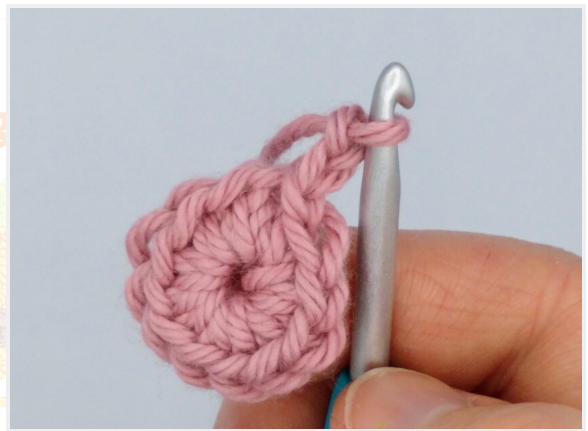
Ch 2 (counts as your first dc)