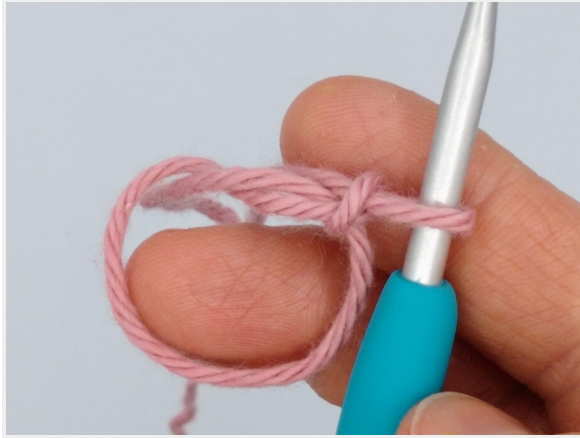
Make a magic ring.

Rnd 4- Place 1 sc into each st around, sl st into the first st, fasten off, and weave in yarn ends.